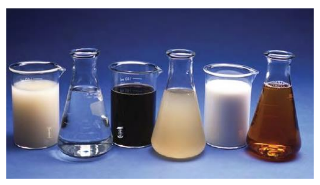
Figure 2- different types chemical admixtures

Chemical admixtures are the elements in concrete other than Portland cement, water, and aggregate that are added to the mix just before or during mixing. Admixtures are largely used by producers to lower the cost of concrete construction, alter the qualities of hardened concrete, guarantee the quality of concrete while it is being mixed, transported, placed, and cured, and resolve specific crises that may arise during concrete operations, they are typically employed to lower casting costs and raise the caliber of concrete. The amount of cement used, the water content, the mixing time, the air temperature, the slump, and the batching processes all have a significant role in the efficiency of chemical admixtures (ACI 212, 2010).[3]