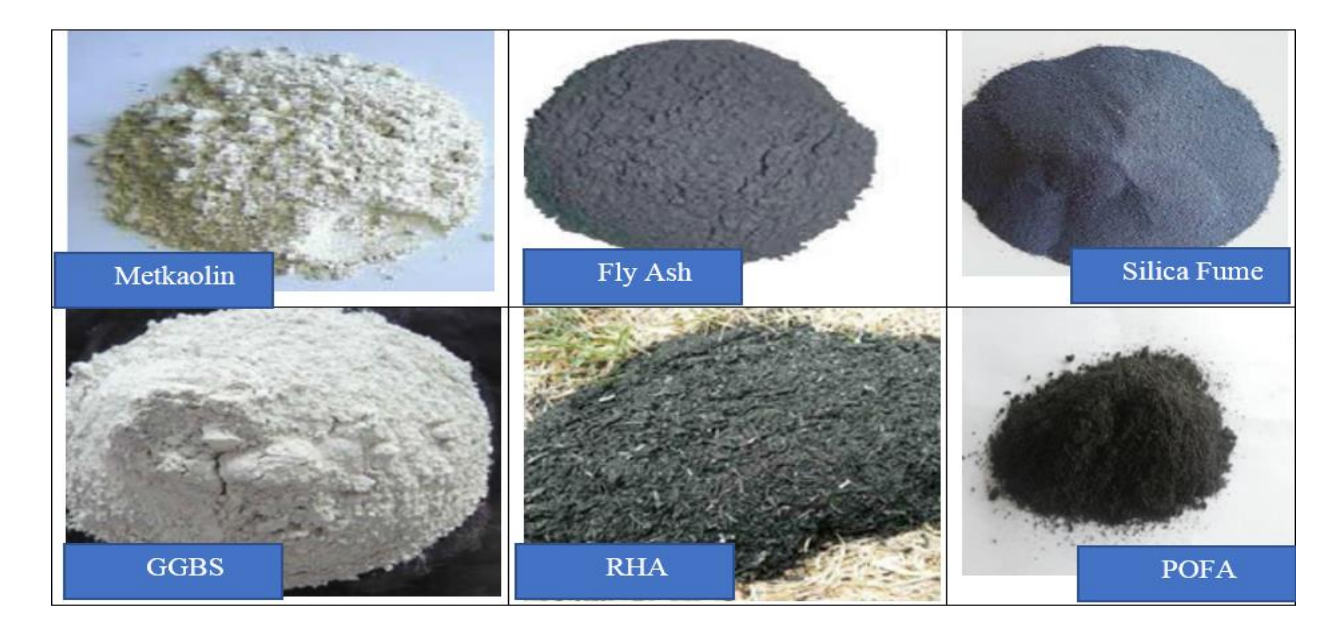
Figure 3- different types of mineral admixtures