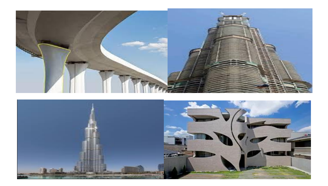
Figure 1- Concrete structure