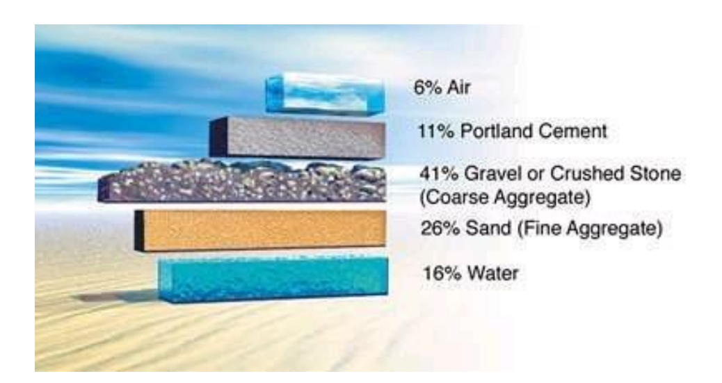
Figure 2- Concrete material ingredients

In general concrete is a material that forms the basis of our modern life. It is the most widely construction material used because it is easy to place and mold, low cost, its ingredients is widely available and it has good compressive strength. Concrete is a composite material consist of aggregates embedded in a hard matrix of cement filling the space between the aggregate particles.